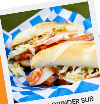
ITALIAN GRINDER SUB

All subs come with a side of house made chips. Substitute for waffle or straight cut fries $2.00