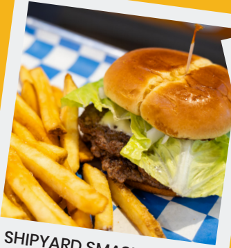
SHIPYARD SMASH BURGER