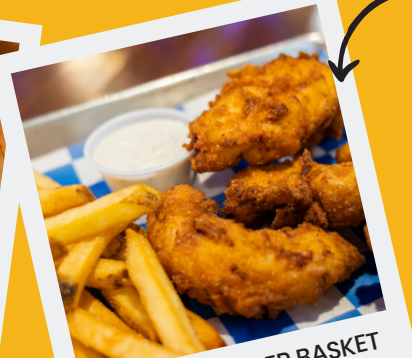
CHICKEN TENDER BASKET