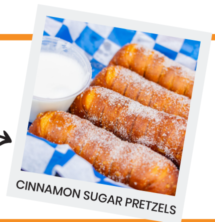
CINNAMON SUGAR PRETZELS